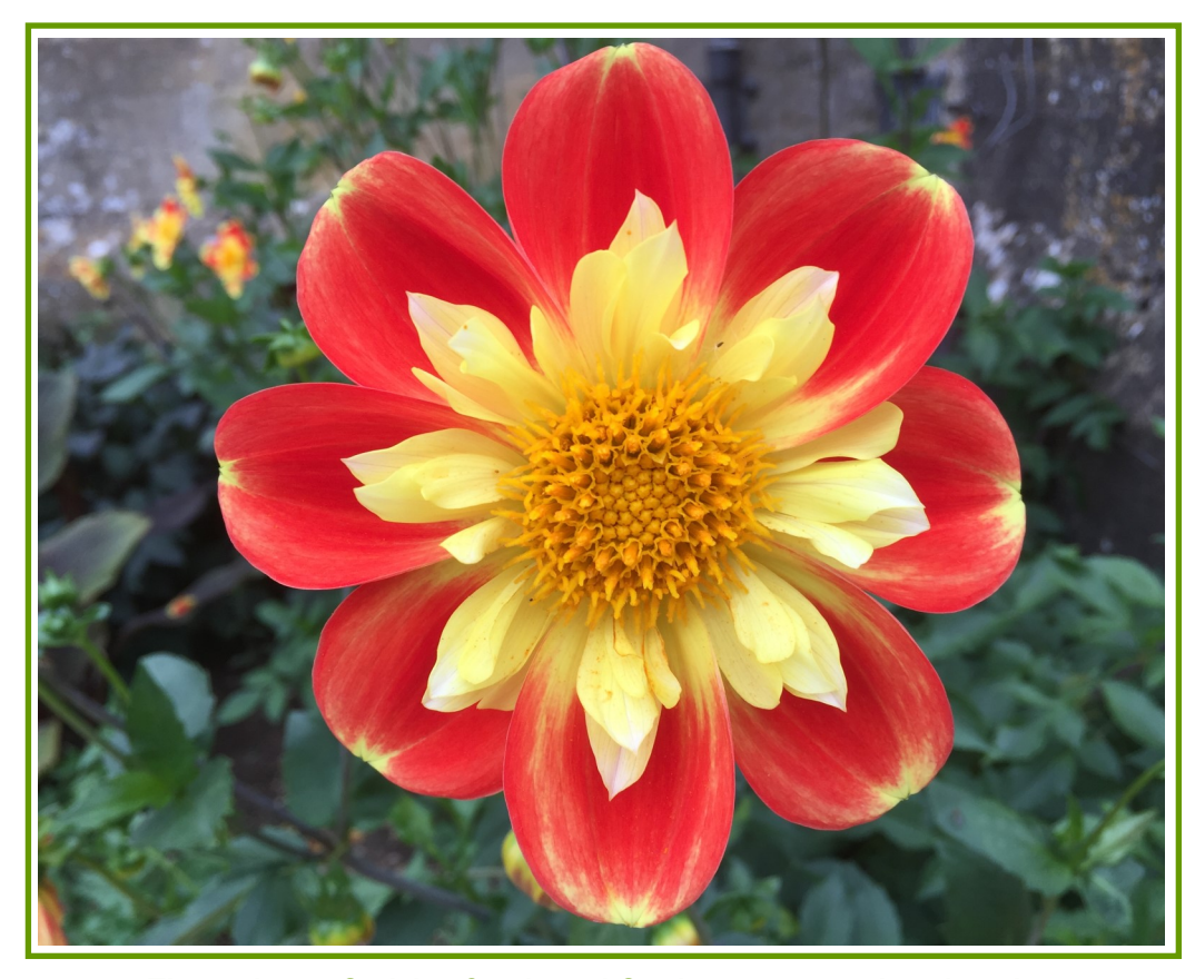
The outing to Sudeley Castle and Gardens was greatly enjoyed